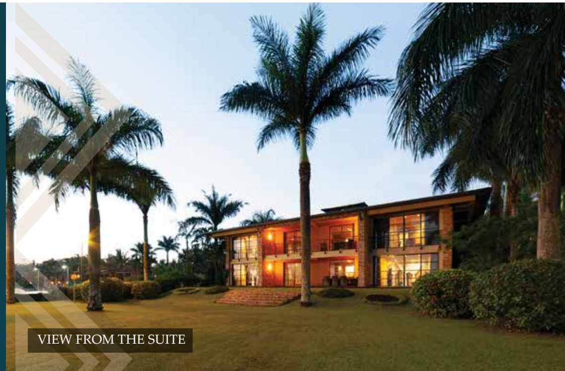
VIEW FROM THE SUITE