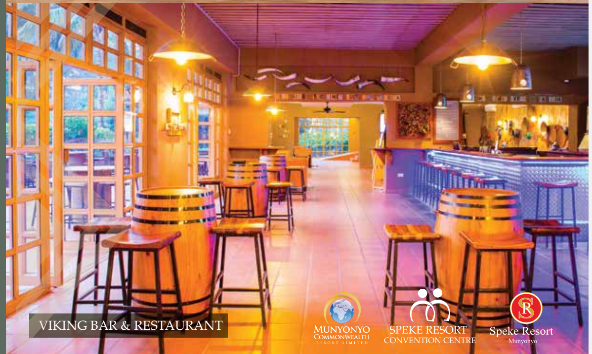
VIKING BAR & RESTAURANT