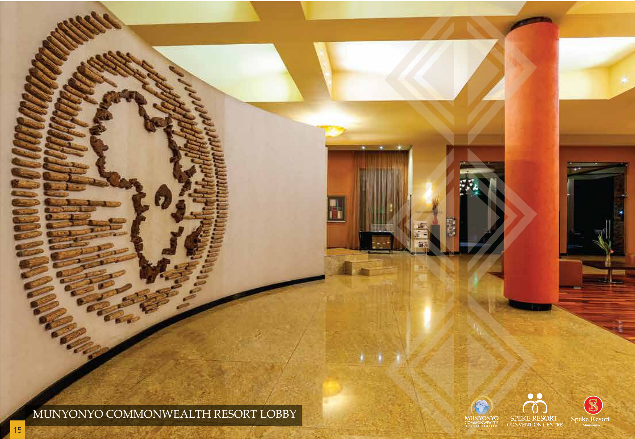
MUNYONYO COMMONWEALTH RESORT LOBBY