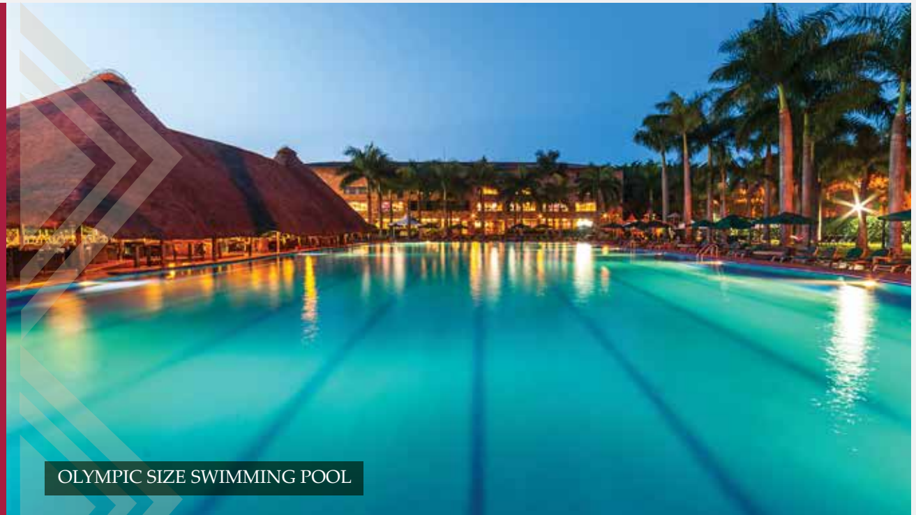
OLYMPIC SIZE SWIMMING POOL